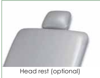
Head rest (optional)