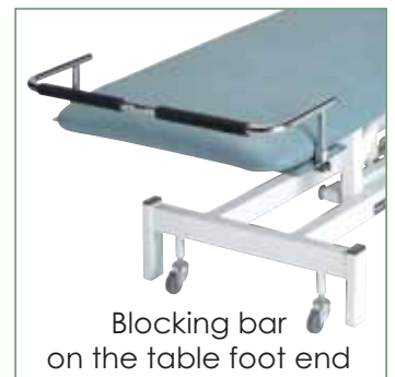
Blocking bar on the table foot end

Technical characteristics are identical to the 2 section electric table on page 23, available in the same colours.