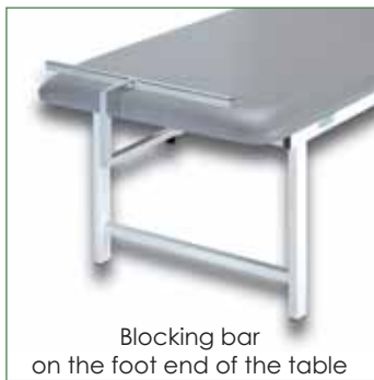
Blocking bar on the foot end of the table