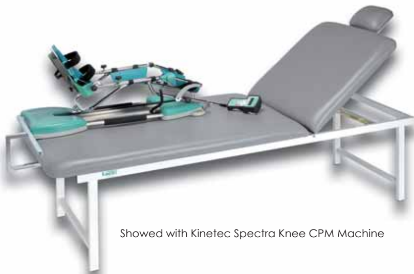
Showned with Kinetec Spectra Knee CPM Machine

Our treatment table is especially adapted to be used in combined in conjunction with our rehabilitation devices.