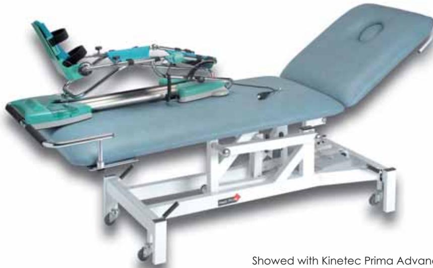
Showned with Kinetec Prima Advance Knee CPM Machine

Our treatment table is especially adapted to the combined use with our rehabilitation devices.